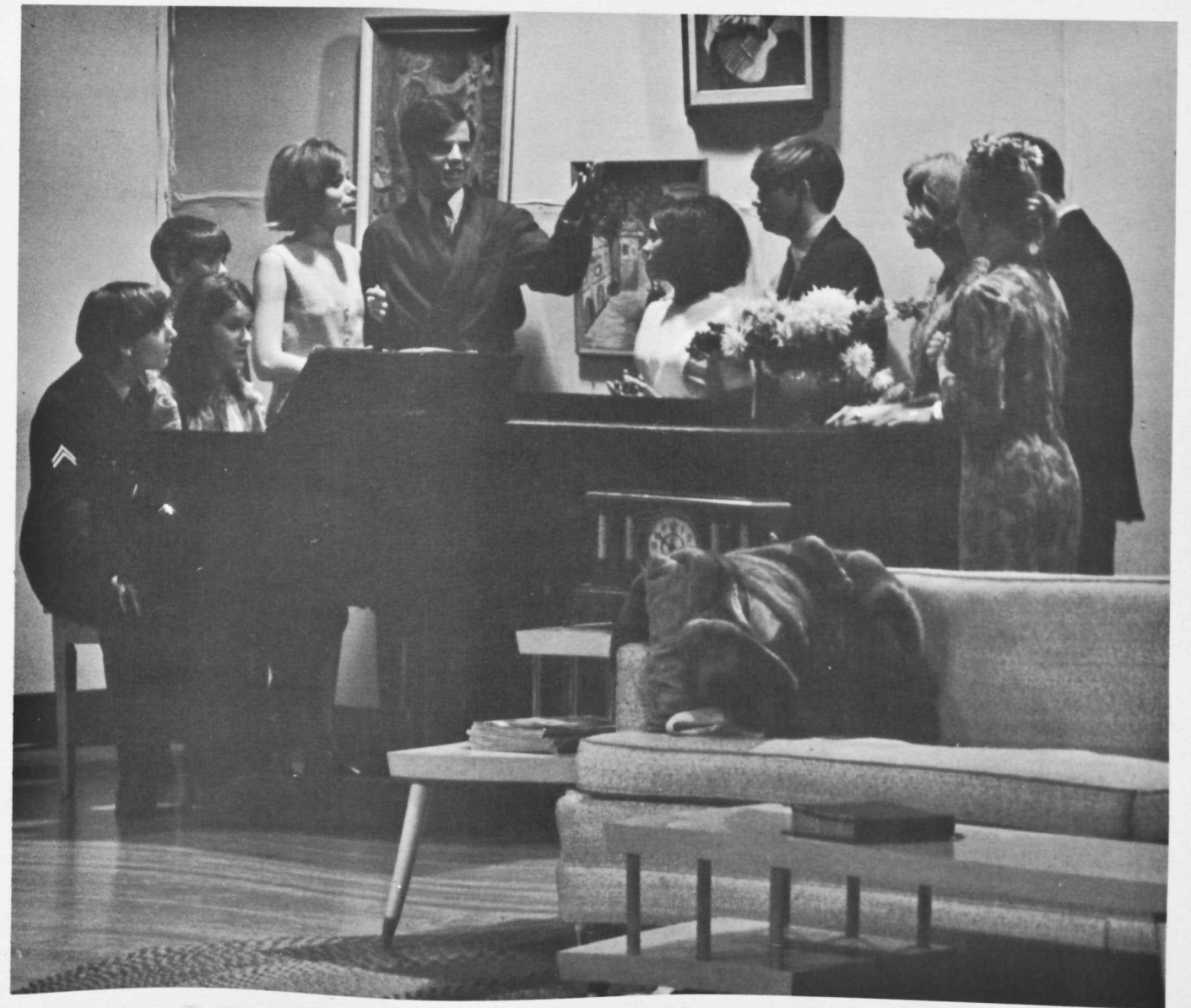
Finale . . .

The Senior class of 1969 presented the three-act play "A Man Called Peter" on Friday and Saturday evenings, November 22 and 23, 1968. The performances were a tremendous success as the new cafeteria was filled to capacity both nights.