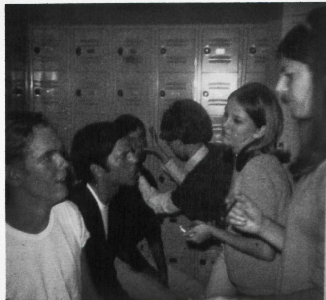
Make Up . . .