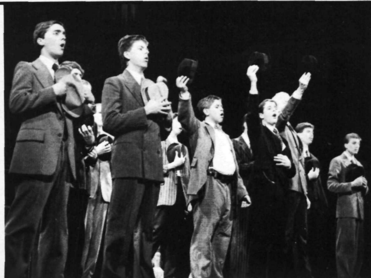
Singing their reverence of "The Oldest Established Floating Crap Game" are the crapsshooters.