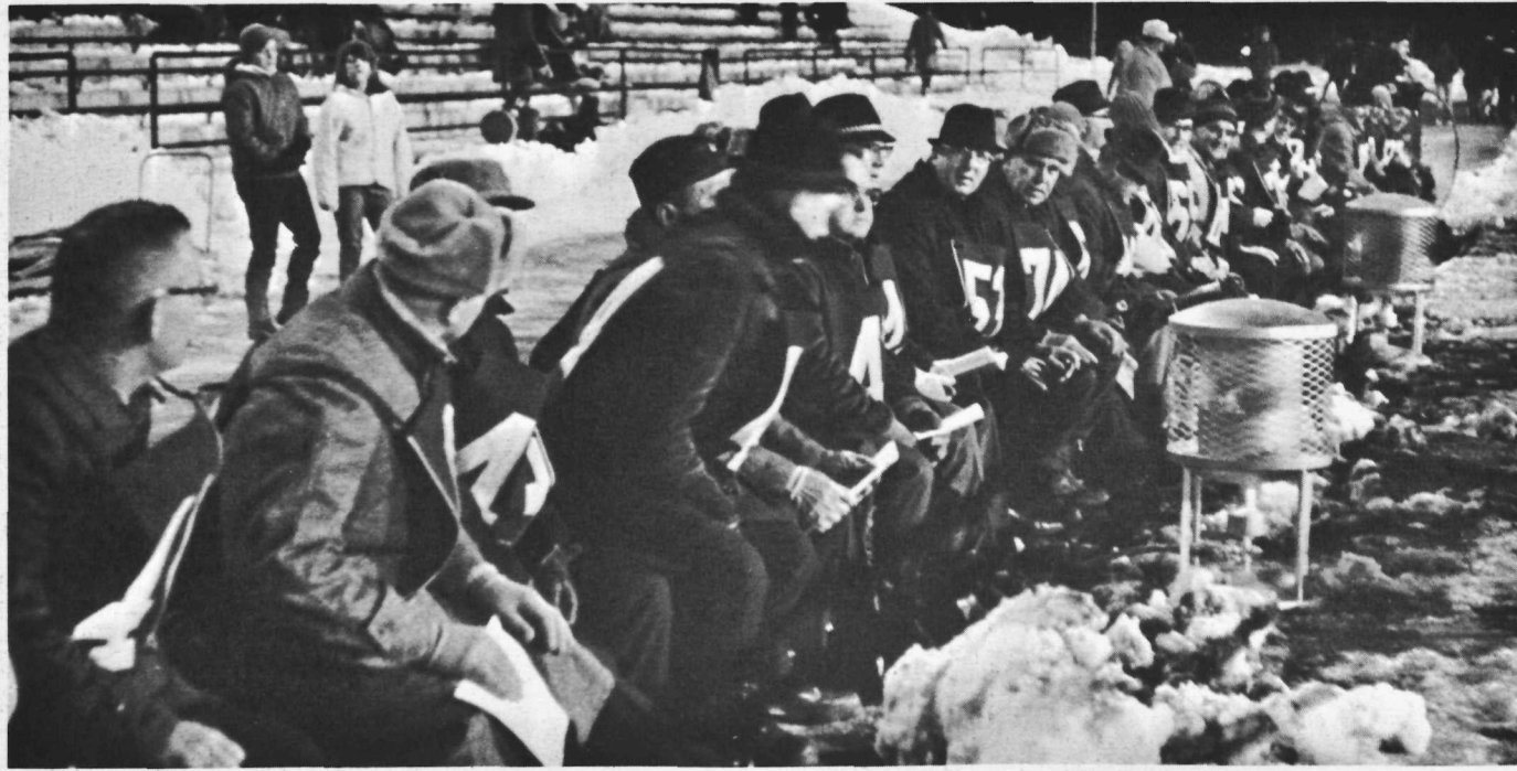
Dads appreciate heaters, but, "We all can't get close!"