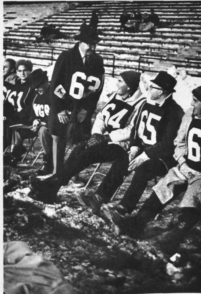
Dads enjoy selves despite inclimate weather.