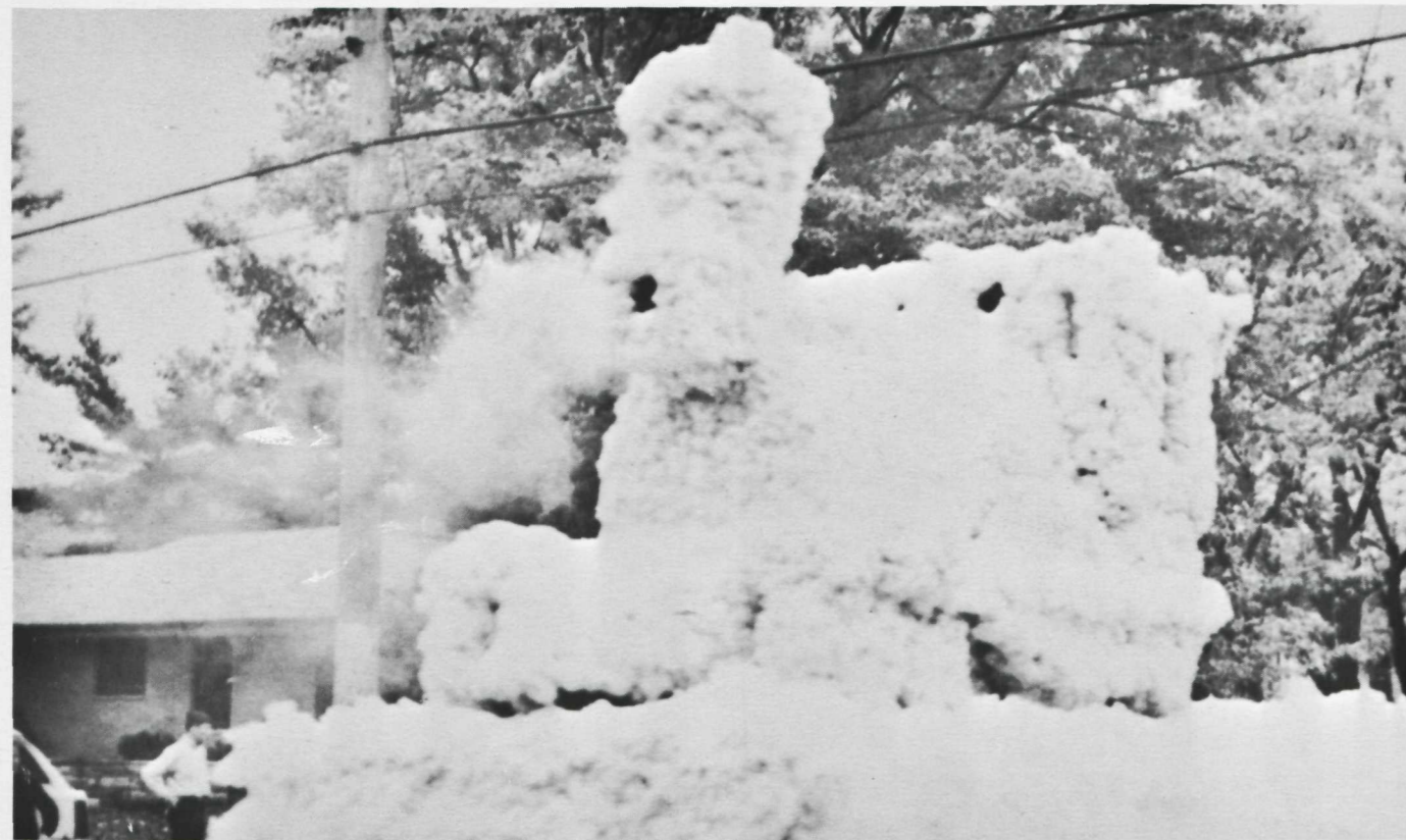
Senior prize winning float.