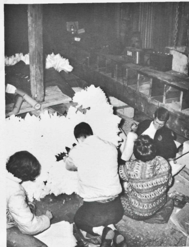
Seniors labor on prize winning float.